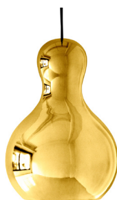
P3 GOLD CHROME