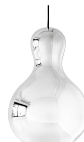
P3 SILVER CHROME